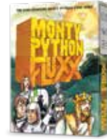
Monty Python Fluxx