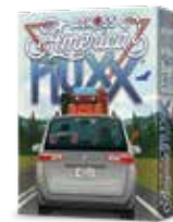
Across America Fluxx

And don't forget to try Looney Labs games on BGA