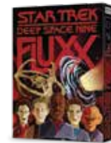
Star Trek DS9 Fluxx