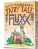
Fairy Tale Fluxx