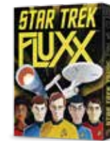
Star Trek Fluxx