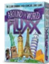
Around the World Fluxx