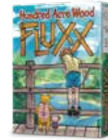
Hundred Acre Wood Fluxx