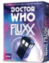
Doctor Who Fluxx